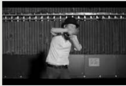
Lotus Flower The King of Limbs (2011)