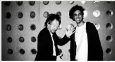
Radiohead From 1992-2003

Radiohead were an English rock band from Abingdon, Oxfordshire, formed in 1985. The band consists of Thom Yorke (lead vocals, guitar, keyboards, bass guitar, keyboards, tube instruments), Colin Greenwood (bass, DJ), Philip Selway (drums, percussion) and Ed O'Brien (guitar, backing vocals). Radiohead released their debut single "Creep" in 1992. The song was initially unsuccessful, but became a worldwide hit several months after the release of their debut album, Pablo Honey (1993). Radiohead's popularity rose in the United Kingdom at the release of their second album, Pablo Honey (1993). Radiohead's third album, OK Computer (1997), provided them an greater international fame. Featuring an expansive sound and themes of modern alienation, OK Computer is often considered as one of the landmark records of the 1990s. IdA (2002) and Amnesiac (2001) marked an evolution in Radiohead's musical style, as the group incorporated experimental electronic music, funk and jazz influences. IdA , through democratic songwriting at the time of its release, became frequently recognized as one of the most popular albums of the