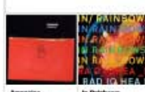
In Rainbows From 2007-2010