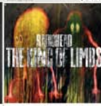
The King of Limbs From 2011-2013